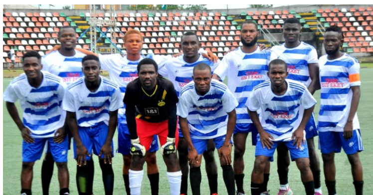
ESIT EKET TEAM