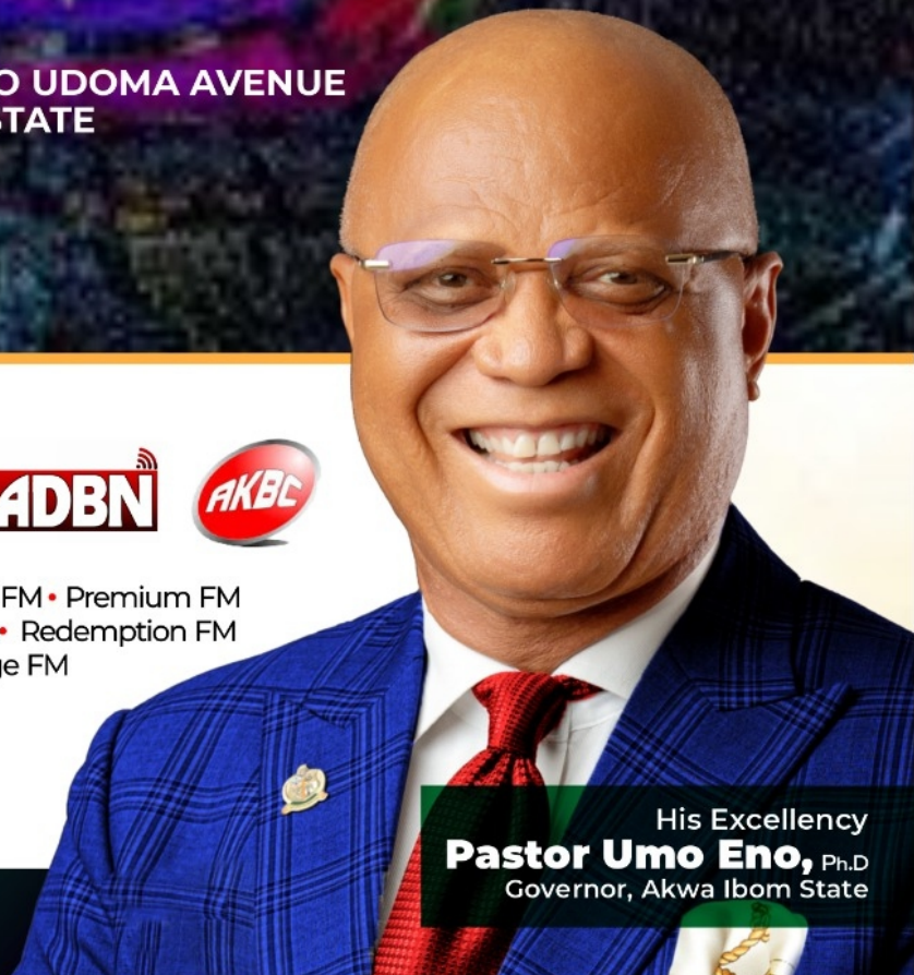
His Excellency Pastor Umo Eno, Ph.D Governor, Akwa Ibom State